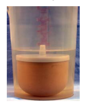
Soaking the Ceramic Cartridge