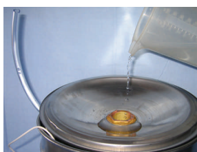
Pour into up-turned base