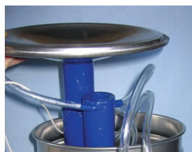
Place into holding vessel