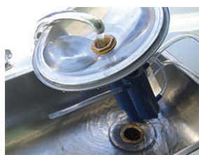
Flush column and packing