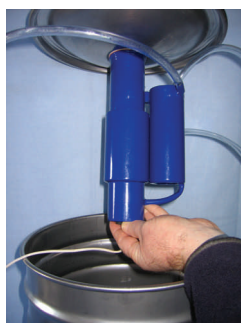
Remove bung and drain