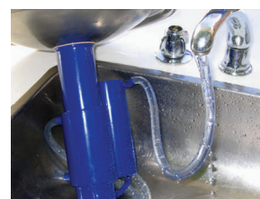
Flush condenser via tube